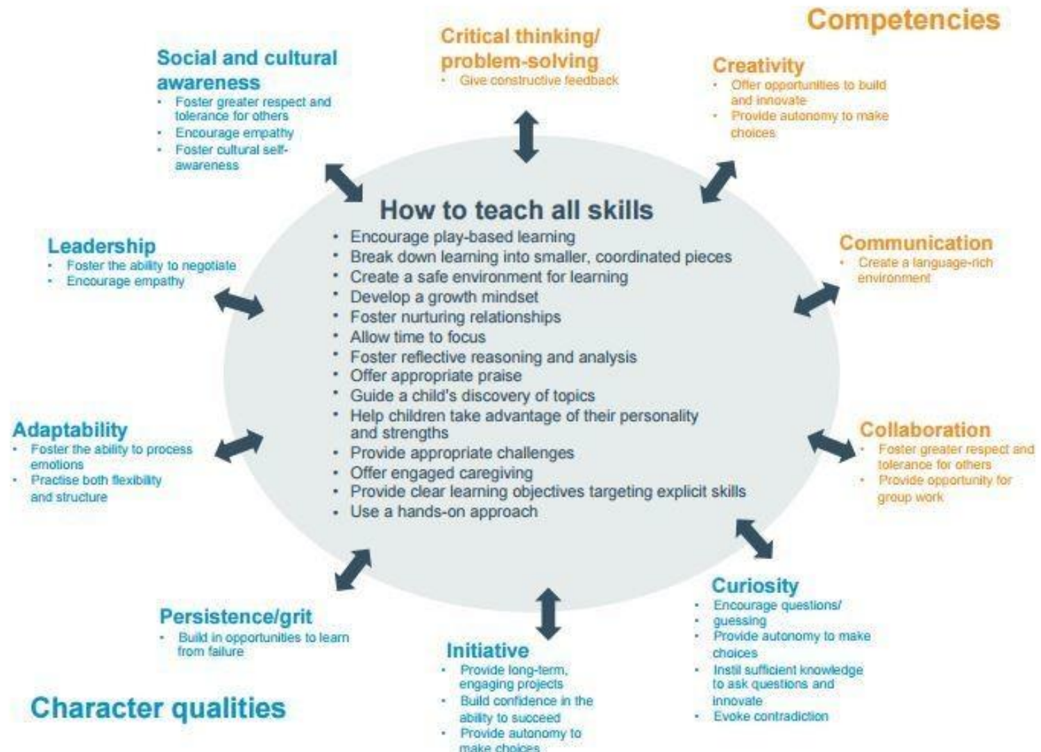
Exhibit 3: A variety of general and targeted learning strategies foster social and emotional skills